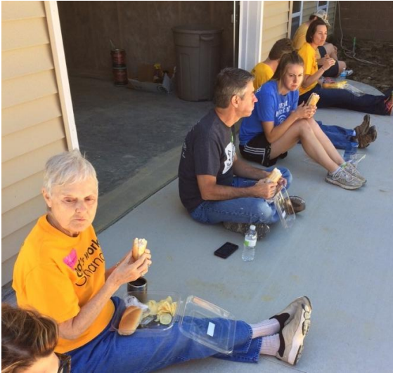
Senior Saints at the Ballpark