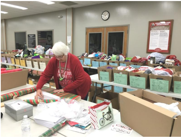
Children's Christmas Program