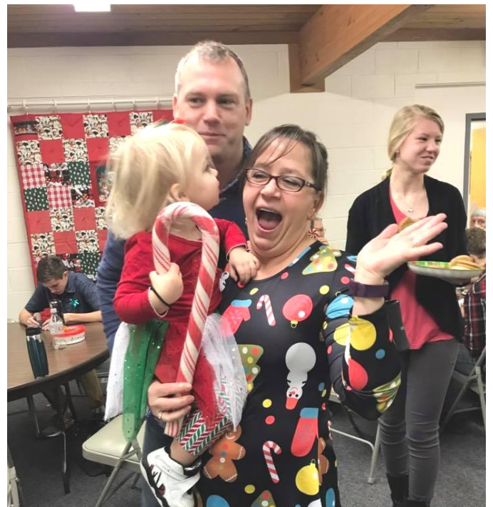
Santa's Helper Taking a Break!